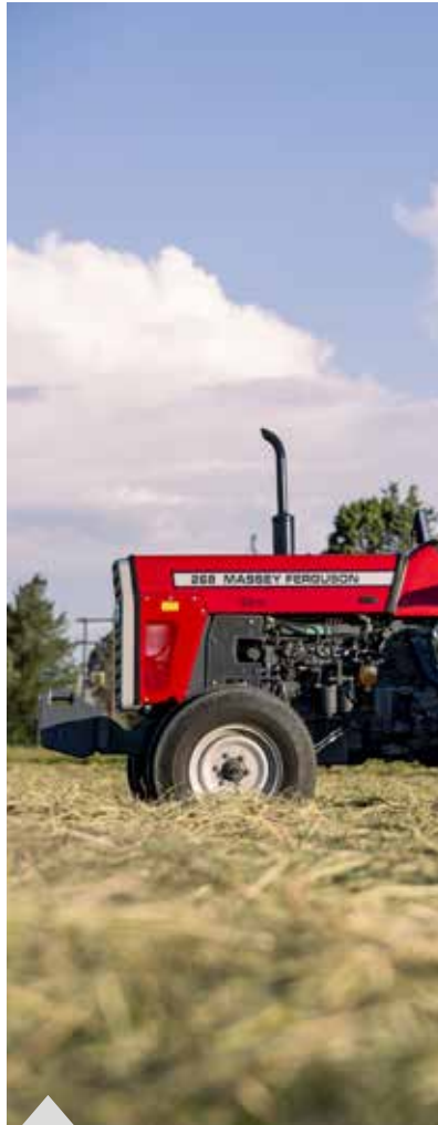
Page 08 Front Axle