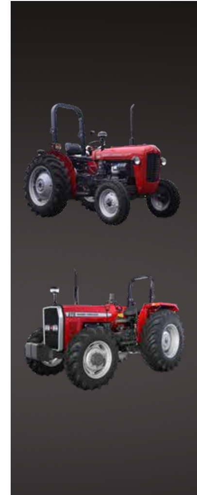
Page 10 Specifications