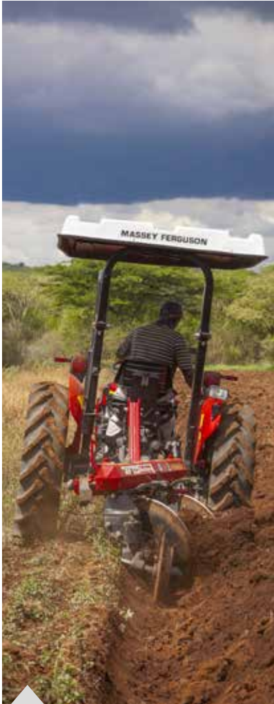
Page 07 Rear Axle