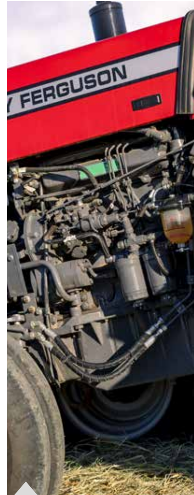
Page 05 Engine