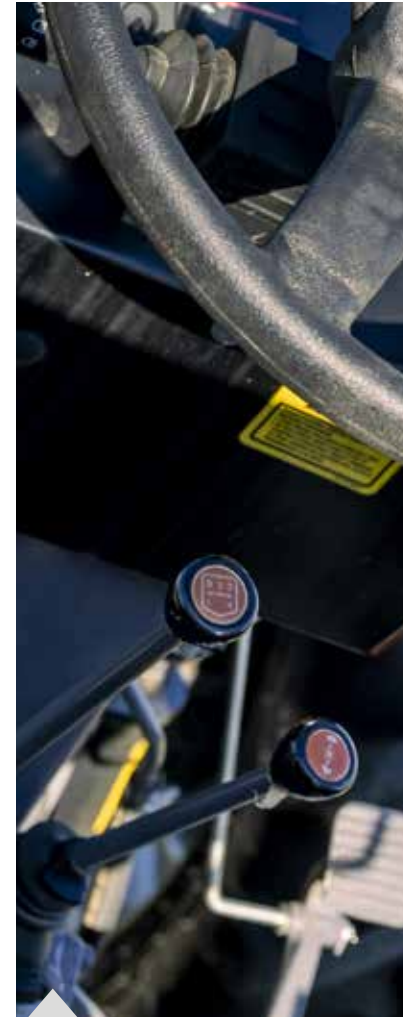
Page 06 Transmission