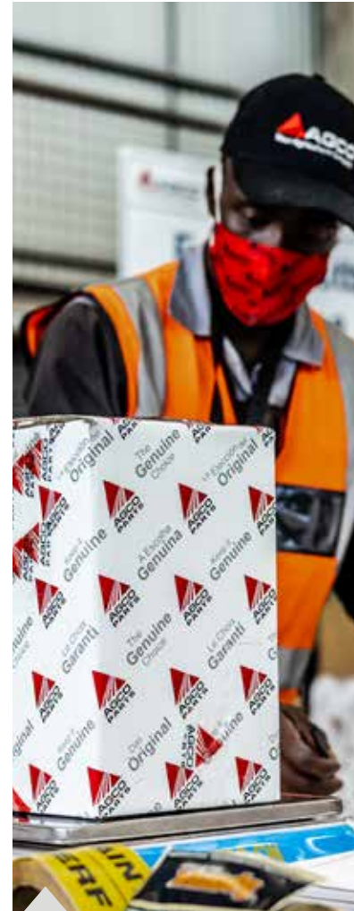
Page 09 Parts and Service